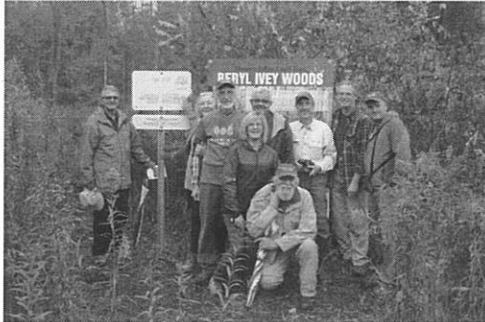
TTLT Directors and Executive Director.

On October 14, 2017 we celebrated the permanent protection of Beryl Ivey Woods—a 50-acre parcel of rich Carolinian forest located in Southwest Middlesex. This property is nestled within the Skunk's Misery Natural Area, one of the most significant blocks of forest in the Carolinian region of southern Ontario. Beryl Ivey Woods has long been recognized as a valuable property for protection. It is situated in an Area of Natural and Scientific Interest (ANSI), and boasts provincially significant wetlands. It is contiguous with other woodlands which will help to ensure suitable habitat for