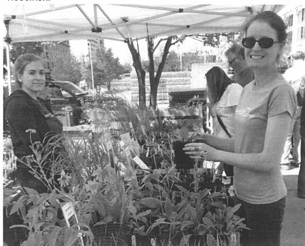
Native Plant Sale—May 13, 2017.