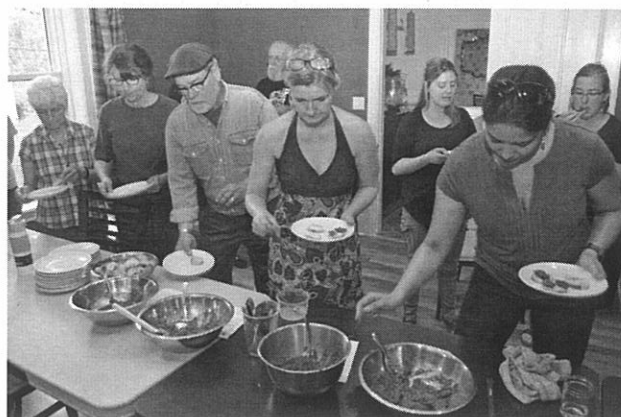
Garlic Mustard Pesto Workshop—May 17, 2017.

Thames Talbot Land Trust respects your privacy and will not share your personal information. From time to time we may contact you with information about the Land Trust and its activities which we believe are of interest to our members and supporters. For more information about our privacy policy visit