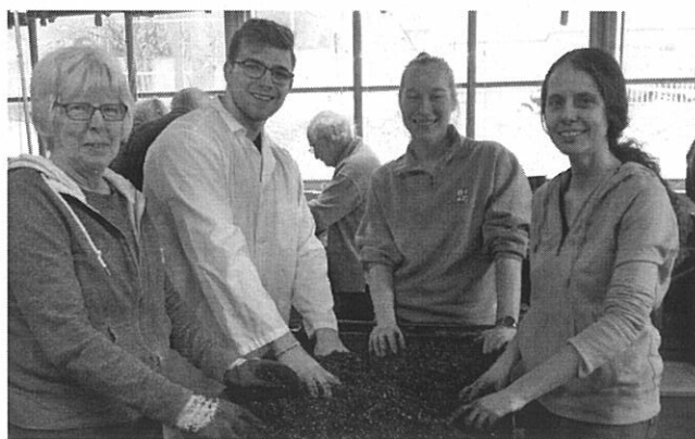
Greenhouse Workday—March 6, 2017.