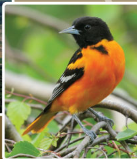
Baltimore Oriole

Working together to leave a legacy of healthy landscapes.