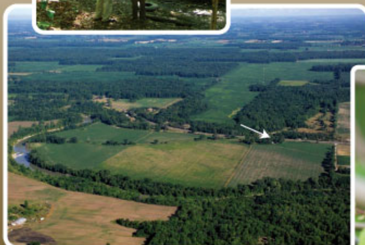
Aerial View 2007

Less than 1 km west of Wardsville (former Highlands Golf Course) on the north side of the road, in the Municipality of Southwest Middlesex.