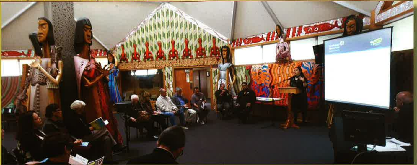
E wānangahia ana te Kaupapa Ture o Aotearoa ki te marae o Awarua ki Motupohue i Murihiku.

Ki te nuinga o tātou he mea uaua tonu te kite atu i te pānga o te waihangananga o tētahi Kaupapa Ture mā Aotearoa ki ngā mahinga o ia rangi i tēnei whenua. Ka puta mai te pūrongo a te Ranga Kaupapa Ture ā te marama o Hakihea – kāore e kore ka whakamāorihia taua kōrero mā tātou. Heoi, ka nui tērā ki te ki ake, āe, kua whai wāhi mai te reo Māori ki te Kaupapa Ture o Aotearoa?