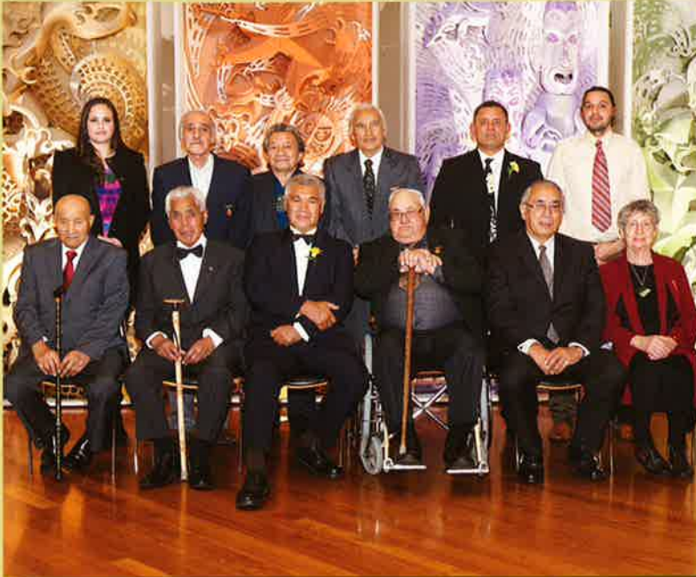
Ko te hunga i wamarie i Te Pō Tuku Taonga a Te Waka Toi 2013.

Ko ngā toi huarewa rātou ko ngā toi pitomata ērā i whakatairangahia ki Te Pō Tuku Taonga a Te Waka Toi i tū ki Te Papa Tongarewa, ki Pōneke i te pō o te 31 o Hereturikōkā.