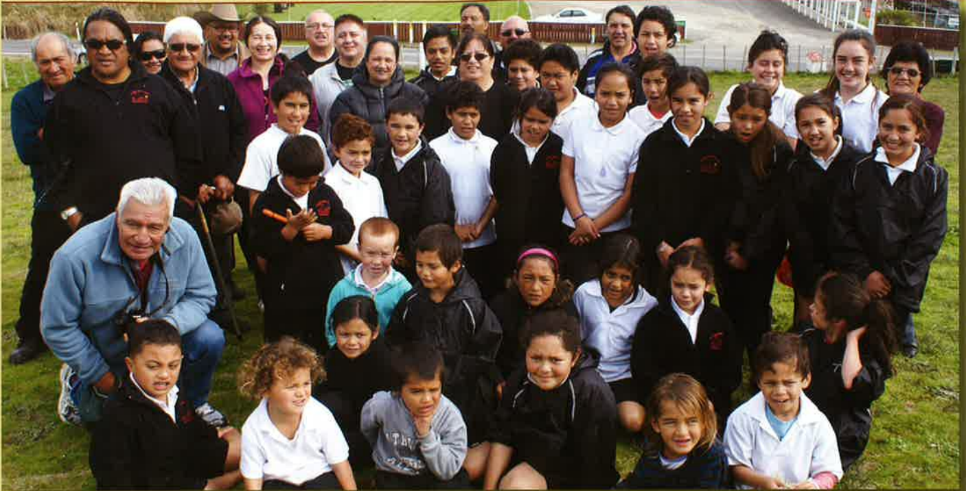
Ko Te Kura Mana Māori o Whangaparāoa rātou ko ngā Kaiwhiri me te Tumuaki o Te Taura Whiri i te Reo Māori, ko ngā kaumātua o te marae o Ōtuwhare.

Kei raro i te maru o Tihirau kei te tahatai o Whangaparāoa, Te Kura Mana Māori o Whangaparāoa e tū ana. Ahakoa kei raro iho i te 70 ngā ākonga i te kura nei, e pūmau tonu ana rātou ki tō rātou kaupapa me ngā āhuatanga motuhake o te kura. Ko ngā tikanga o te manaakitanga me te kaitiakitanga tērā, me te mau pūmau ki te reo o Te Whānau-a-Apanui.