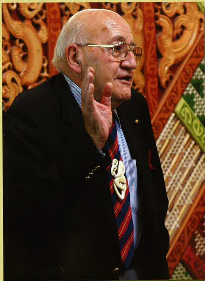
Ko Tā Tipene O'Regan, Heamana o te Ranga Kaupapa Ture.

arero Māori. Ko te whāinga nui pea kia rahi ake te hunga e mōhio ana ki te reo Māori i roto i te Whare Pāremata, kia nui ake hoki ngā take e taupatupatuhia ana mā te reo Māori.