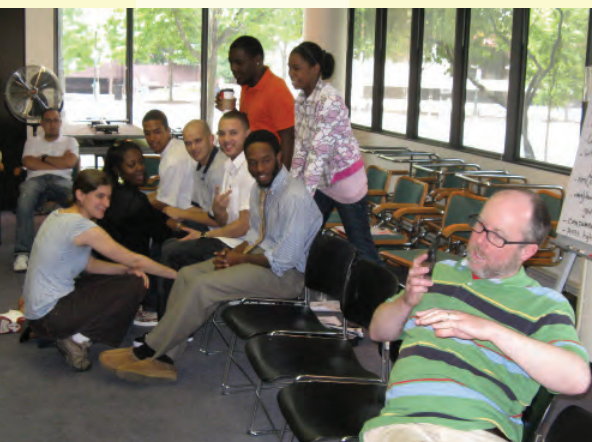
Left image: UFE's "10 Chairs" activity; one person gets seven chairs!

While it has been a good year, it is clear that our work remains important. The fundraising, staff development and systems improvements we achieved in 2009 and 2010, along with the guidance of a comprehensive strategic plan, will go a long way toward clearing our path for a strong financial and programmatic future.