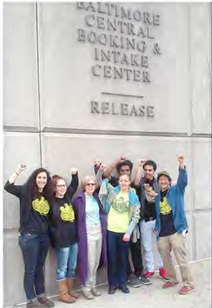
Top left. The "incinerator 7" upon release from central booking.