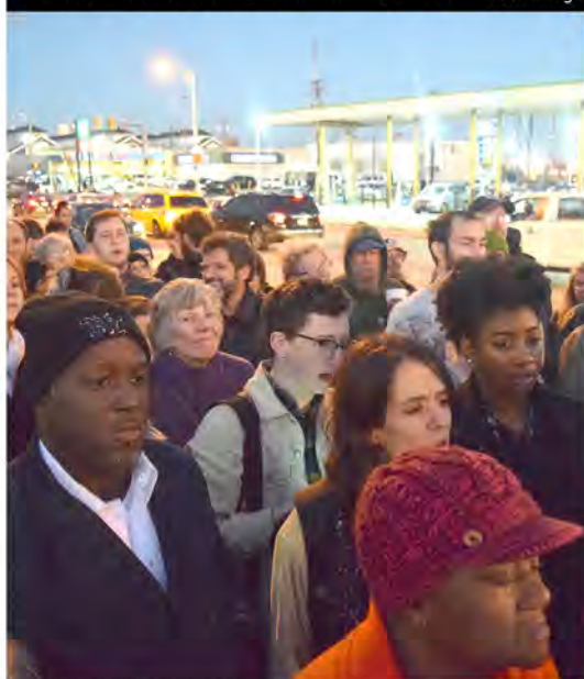
Bottom Right. Long time Brooklyn Park leaders calling on MDE to enforce the law.