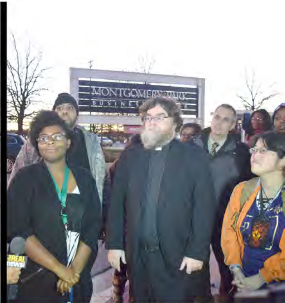
Top Right. Community and faith leaders talk to the press on Dec 15th.