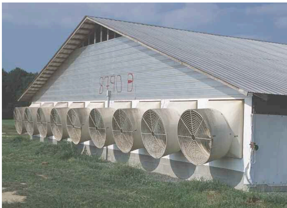
Adding more to the carbon footprint: large fans keep pigs cool in North Carolina.

Finally, we believe that FAO has overlooked some emis-