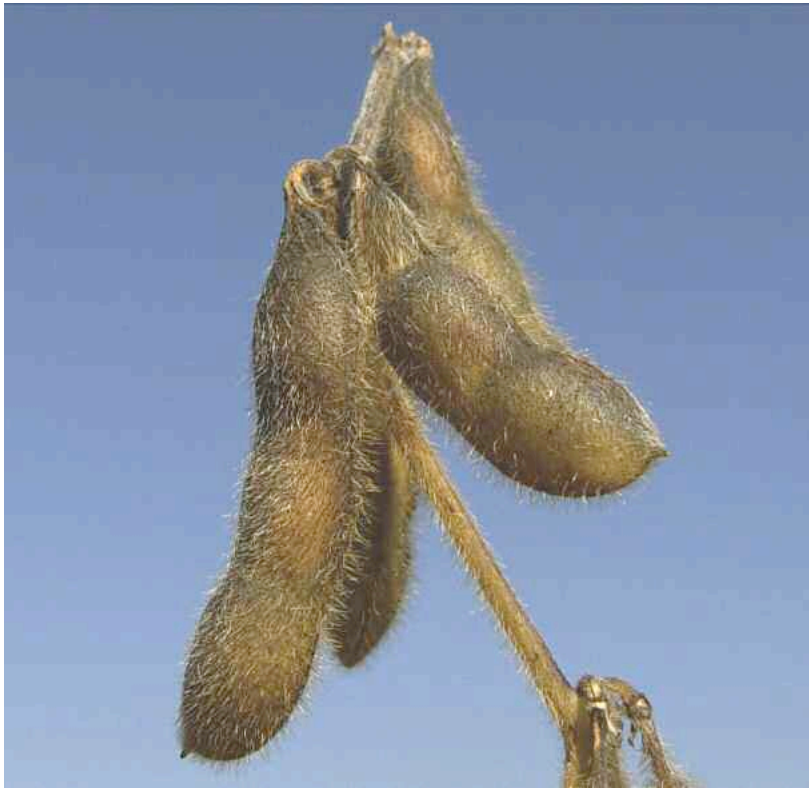
The mighty analog: soybeans await harvest on a Maryland farm.

ment projects in developing countries. If those standards were to frown upon investments in large-scale livestock projects, then a company with a meat or dairy analog project would be well positioned to attract investments.