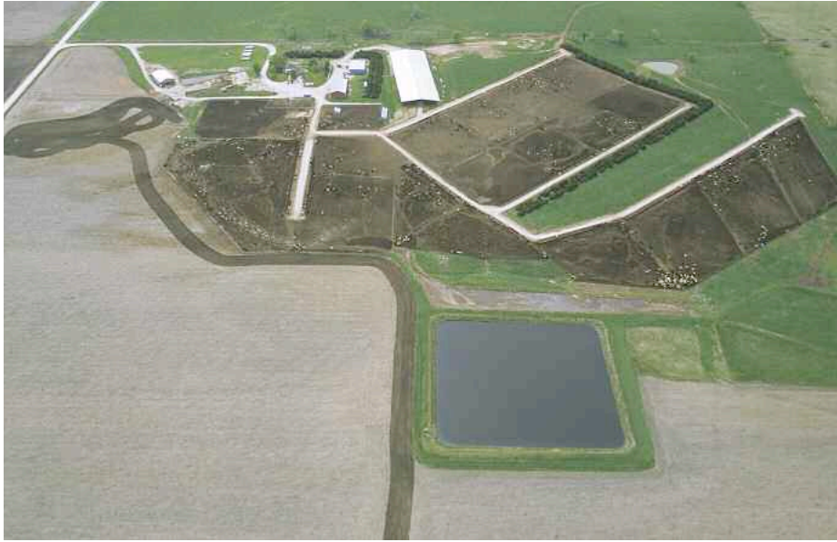
A Kansas feedlot operation with waste management lagoon in the foreground.

is by destroying natural forest. Growth in markets for livestock products is greatest in developing countries, where rainforest normally stores at least 200 tons of carbon per hectare. Where forest is replaced by moderately degraded grassland, the tonnage of carbon stored per hectare is reduced to 8.