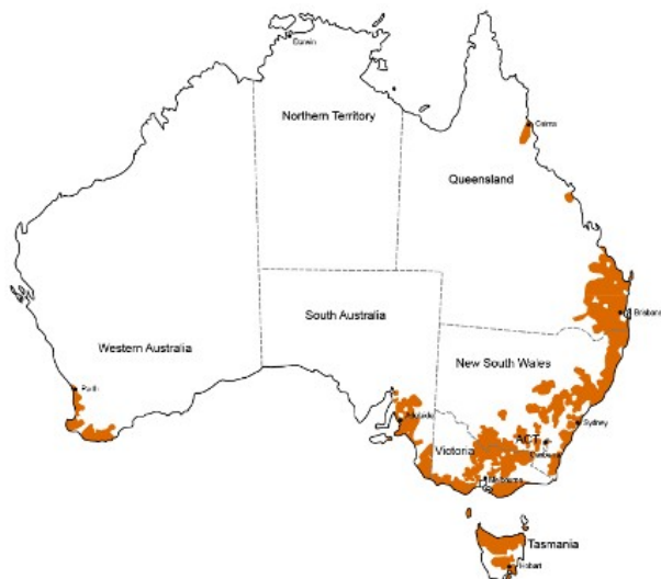
Australian Dairy Industry: The Basics [18]