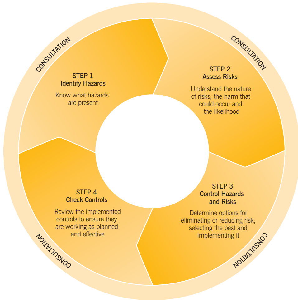
Figure 1 – Steps in controlling OHS hazards and risks