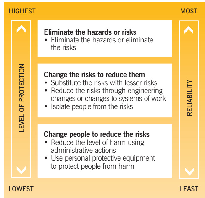
Figure 3 – Effectiveness and reliability of controls

Step 1 and 2 will provide information about the hazards and risks in the workplace and their likelihood and degree of harm.