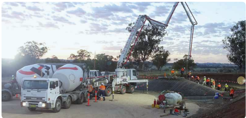
PHOTO: Turbine base construction, Bodangora Wind Farm. © Infigen Energy.

With wind energy one of the cheapest sources of new power in Australia and with prices still coming down, 35 a sustainable wind industry can continue to grow beyond 2020, generating good jobs and contributing to diverse and thriving regional communities.