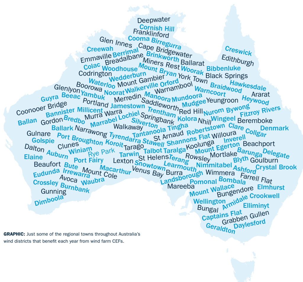
GRAPHIC: Just some of the regional towns throughout Australia's wind districts that benefit each year from wind farm CEFs.

These types of contributions have shown that the best outcomes are most often reached through good communication and collaboration between projects and communities. 14