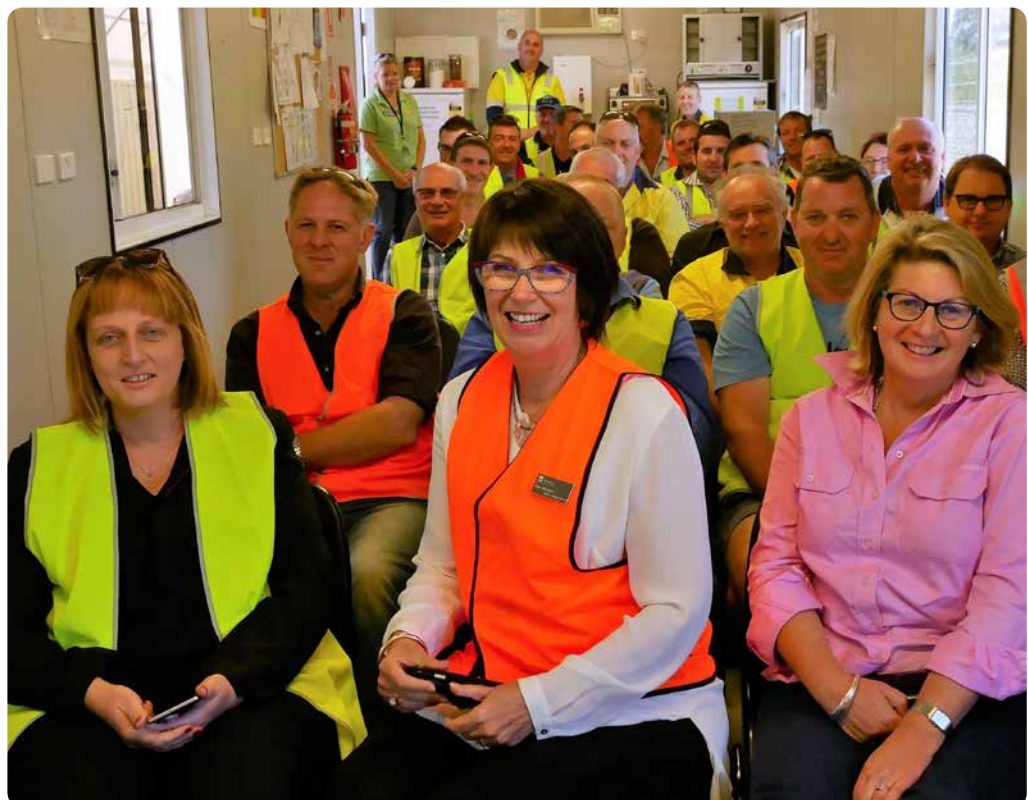
PHOTO: Vocational education teachers from across New England and North West NSW visit Sapphire Wind Farm. © Sapphire Wind Farm.

A number of CEFs direct funds towards enhancing sustainability, such as the Clean Energy Program at Gullen Range Wind Farm and the Denmark Wind Farm Community Sustainability Fund. Others accept a broad range of requests, with geographical boundaries, grant size limits or other mutually agreed objectives and scope.