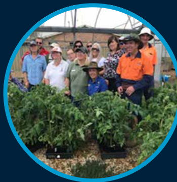
PHOTO (ABOVE): Inverell Community event.