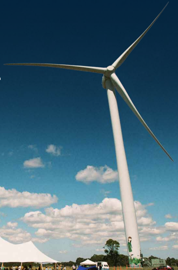
PHOTO: Community event at Hepburn Wind. © Studio Aton for Hepburn Wind 2017 at the Pioneering Communities Event.

WITH FOURTEEN WIND FARMS CURRENTLY UNDER CONSTRUCTION THAT ANNUAL FIGURE WILL INCREASE TO BETWEEN $30 AND $32.5 MILLION.