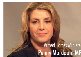
Armed Forces Minister Penny Mordaunt MP

It is NATO that has kept peace in Europe since 1948. Anything that weakens that alliance will diminish our security. EU attempts to set up its own operations, security structures and even armed forces take resources away from the organisation that really protects us.