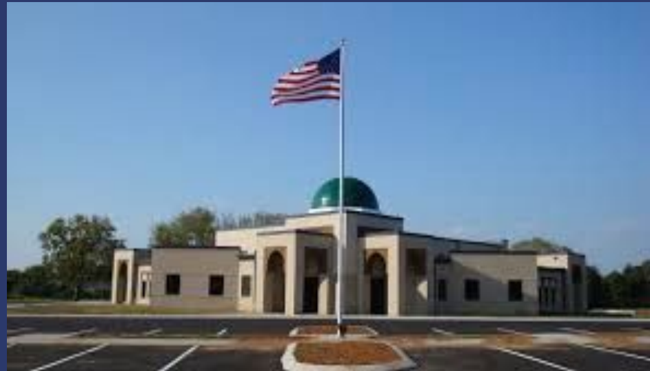
Islamic Center of Murfreesboro