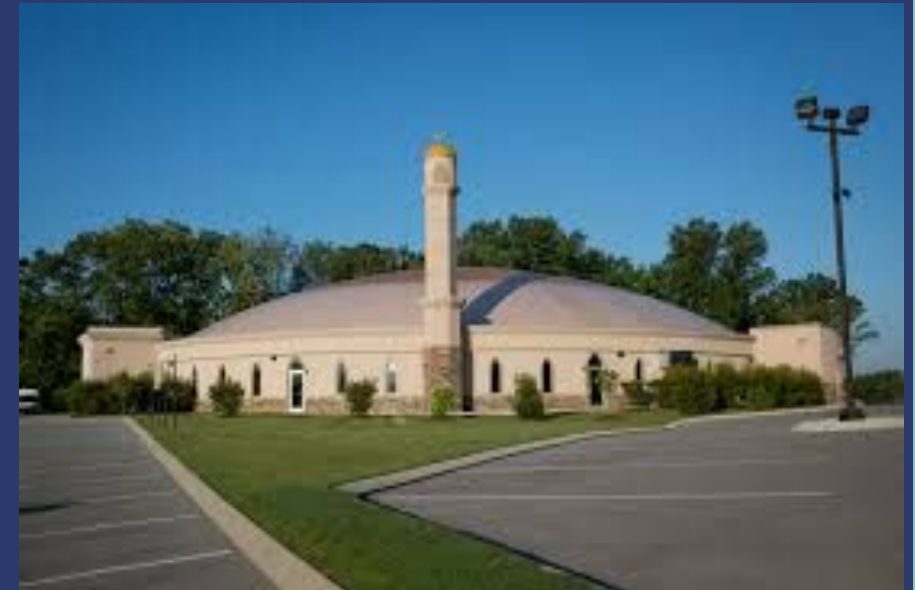
Islamic Society of Greater Chattanooga