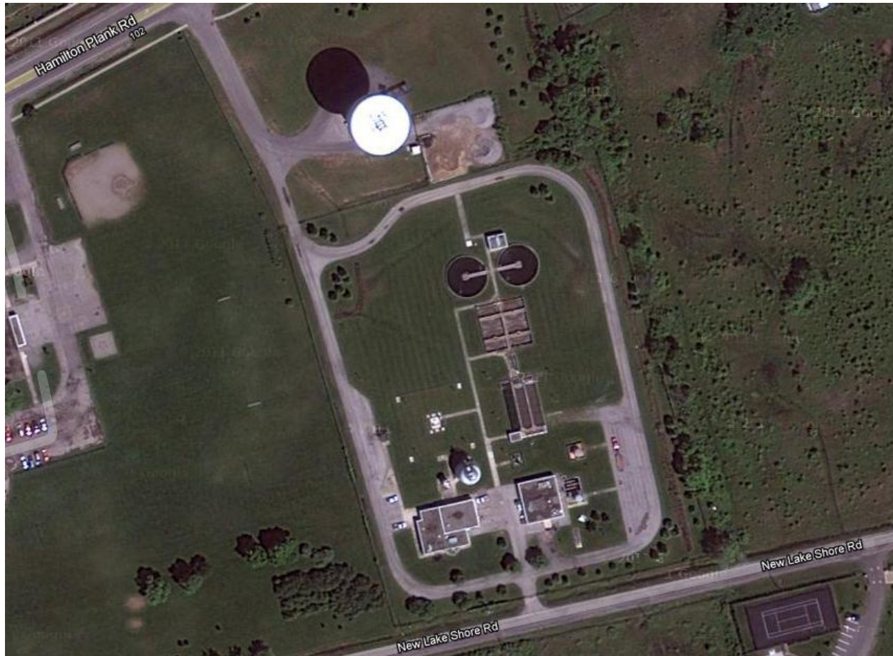
Figure 2. Aerial View of the Existing Port Dover WPCP

In 1990 the Port Dover WPCP underwent a major upgrade from a primary sewage treatment facility to a secondary sewage treatment facility. The County's Official Plan and more importantly the Lakeshore Secondary Plan identified Port Dover as a hub of residential and tourism growth for the next 16 years. The Lakeshore Secondary Plan predicts that Port Dover will double in population from 6,400 to 12,800 persons by 2026. Norfolk County has to be prepared to accommodate this type of significant growth without adversely impacting the water quality of Lake Erie and the surrounding environment. In preparation of this projected growth, Norfolk County Council has approved in principle a 10 year Capital Budget that identified the following components of the upgrade and expansion of Port Dover WPCP.