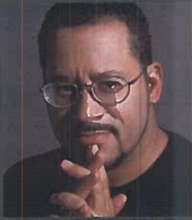
MICHAEL ERIC DYSON, PH.D.

Dr. Michael Eric Dyson is an American Book Award recipient and two-time NAACP Image Award winner. He is one of the nation's most influential and renowned public intellectuals. He has been named one of the 150 most powerful African Americans by Ebony magazine. Dr. Dyson's pioneering scholarship has had a profound effect on American ideas. His books provide some of the most significant commentary on modern social and intellectual thought, interwoven with a combination of cultural criticism, race theory, religion, philosophical reflection, and gender studies. Some of his books provide significant contributions in the area of race and culture, and they include: Making Malcolm X ; I May Not Get There with You ; Come Hell or High Water: Hurricane Katrina and the Color of Disaster ; Debating Race and The Black Presidency: Barack Obama and the Politics of Race in America .