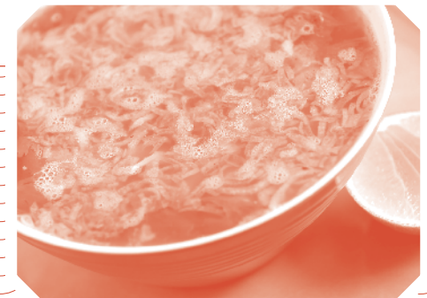
• RAKHAING MUTEE SOUP •

yellow noodle, roasted bean powder, special oil, lime, tofu 6.99