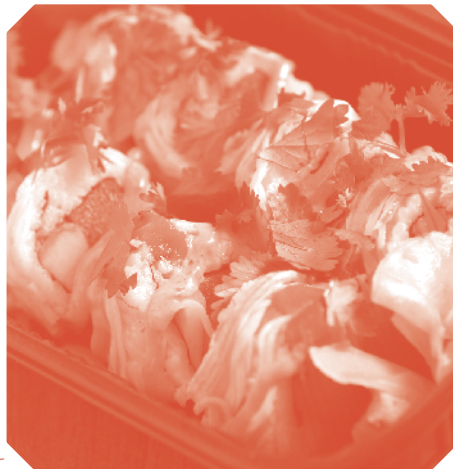
• KHAING SUSHI ROLL •

rice paper, avocado, cucumber, lettuce, carrot, rice vermicelli 4.50