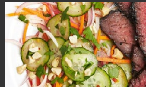
Thai Beef Salad

Choice of: Beef / Chicken / Pork Chili Pepper, Cucumber, Onion, Tomato 7.99