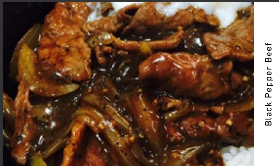
Black Pepper Beef

Beef, Black Pepper Sauce, White Rice, White Egg 7.99