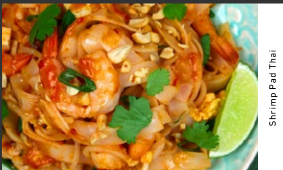
Shrimp Pad Thai

Choice of: Seafood / Chicken / Pork / Beef Vermicelli, Red Pepper, Mint, Thai Brinjal 7.99