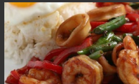
Seafood Pad Ka Pow