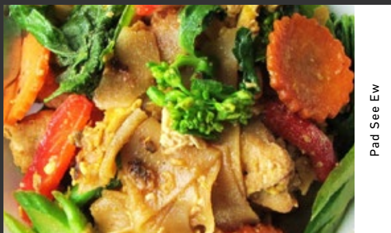
Pad See Ew

Seafood, Meat (optional), Peanuts (optional), Tomato, Scallion, Onion, Cucumber 7.99