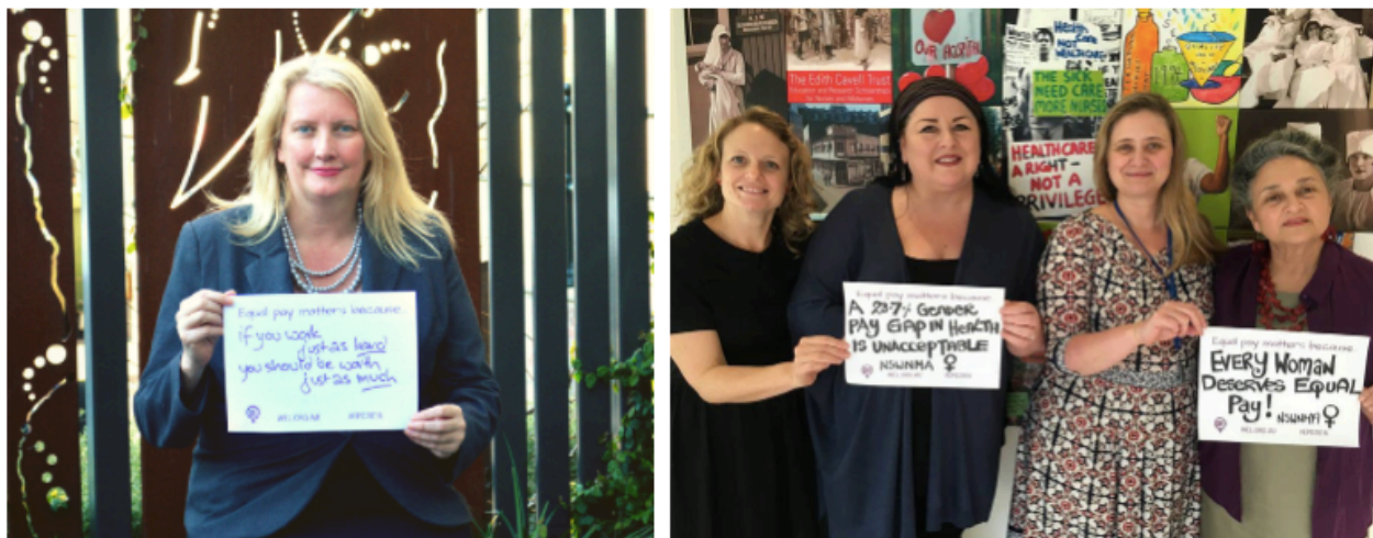
Equal Pay Day 2016

WEL ran an online Equal Pay Day awareness campaign attracting involvement from members and supporters as well as politicians.