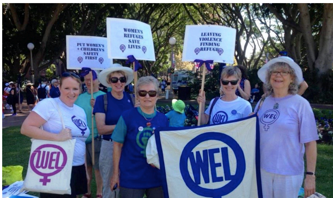
International Women's Day March and Rally 2016