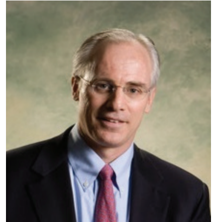
Column Editor: Jeff Voigt WG'85, To learn more about Jeff, click here .

Other opportunities for us to spread the word include SIRIUS XM radio segments with Wharton faculty. Several are scheduled for this year, and we will let you know when they will occur. The preliminary topics include: mobile health; the business case for addressing health disparities and health inequity, mid-market capitalizations; and payer/provider consolidations and their impact on consumers of healthcare.