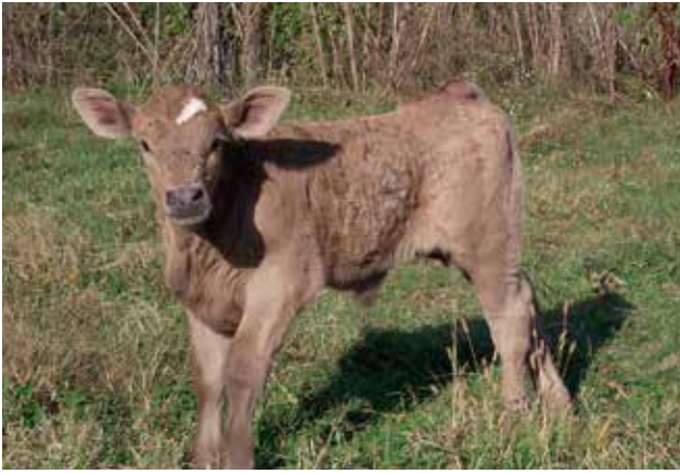
Young livestock are likely to carry higher levels of pathogens than adults.