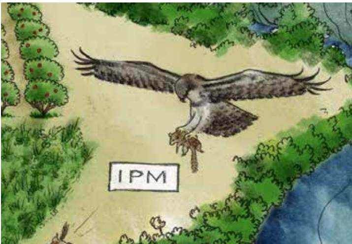
Beneficial natural processes, such as Integrated Pest Management (IPM), help to control rodents.

It is highly unlikely that farmers would ever intentionally sell contaminated produce. In the past, it was long held that common sense approaches were sufficient to ensure produce did not have food-borne pathogens. Animals were discouraged from production areas because they damaged crops. The potential for animal manures applied as fertilizers and soil amendments to result in water and crop contamination with human pathogens was well recognized. However, in 2006, everything changed when an outbreak of E. coli O157:H7 was traced back to a farm on California's Central coast, the center of the state's fresh-cut salad industry. While it was never unequivocally determined how the spinach became contaminated, non-native feral pigs, contaminated irrigation water, and adjacent cattle operations were all considered as possible sources. All wildlife and the habitat they occupied became scrutinized by public health, academia, and especially the leafy greens industry.