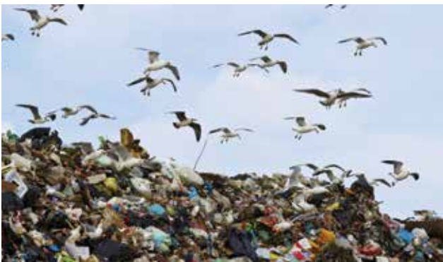
Wildlife living near areas with high levels of pathogens, such as these landfill-dwelling seagulls, may pose a greater risk of transferring pathogens than wildlife not associated with such areas.