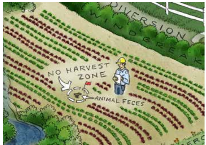
Periodically monitoring for animal damage or feces in the production field ensures a safe harvest.