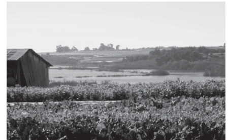
Conservation easements can serve multiple purposes, such as protecting natural areas and open space, scenic amenities, water resources, and agricultural values.