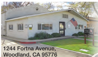
1244 Fortna Avenue, Woodland, CA 95776

Find out more in Kevin's column on page 2!