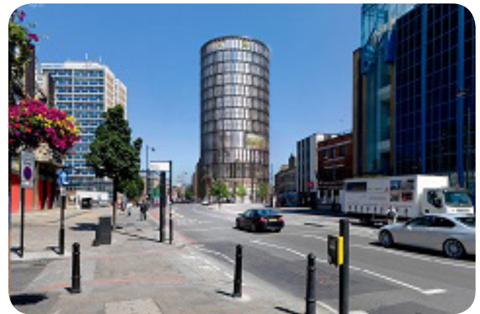
Images of the art'otel

The demolition phase of the project has now commenced on site. This includes the site office set-up, hoarding around the perimeter of the site, and the removal of the existing advertising boards. The scaffolding to encapsulate the existing buildings ready for demolition is scheduled to commence at the end of May, and the main demolition starting the first week of June. The construction phase of the building is due to start in August 2019, with anticipated completion in 2022.